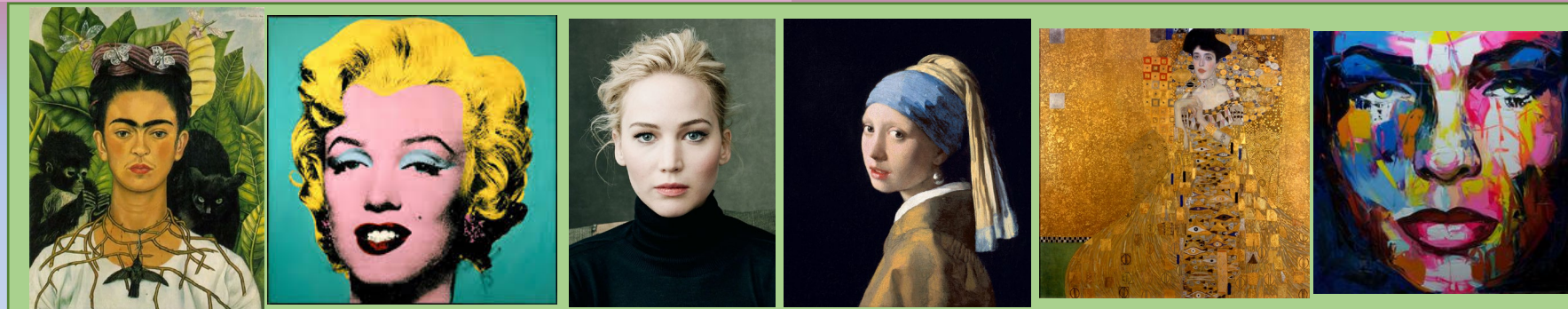
Image Photograph Facial Focus Analyse Features Study Capture Form Balance Composition Light Technical Elements Draw Sketch Paint